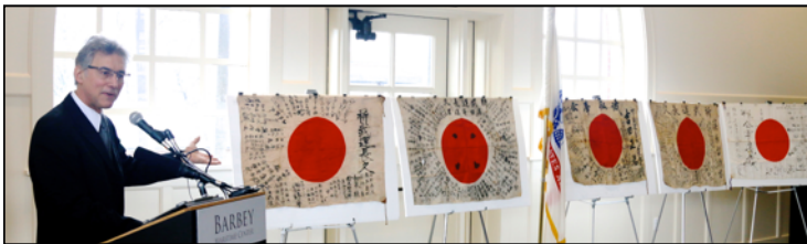
Five Yosegaki Hinomaru were handed into the care of OBON 2015 to begin the search for family in Japan.