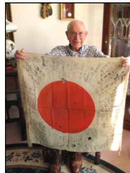
Spoils of War