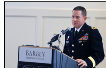
Brig. Gen. Steven Beach